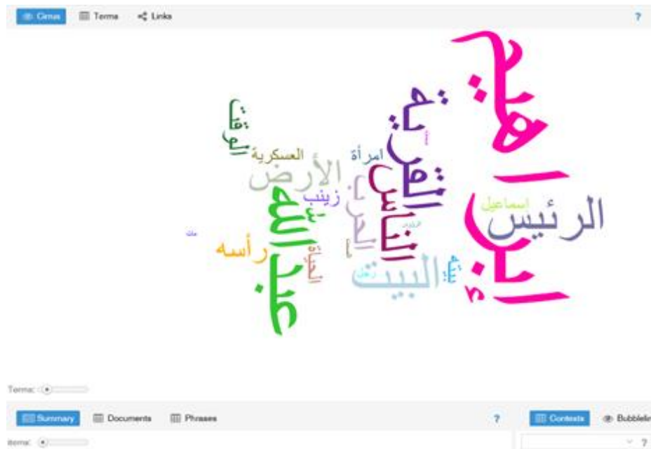
Figure 1. Visualization of words that appear frequently in the novel Hadaaiqa al-Rais in the form of a word cloud .

the relationship between language, power, and the collective trauma that is the story's central focus.